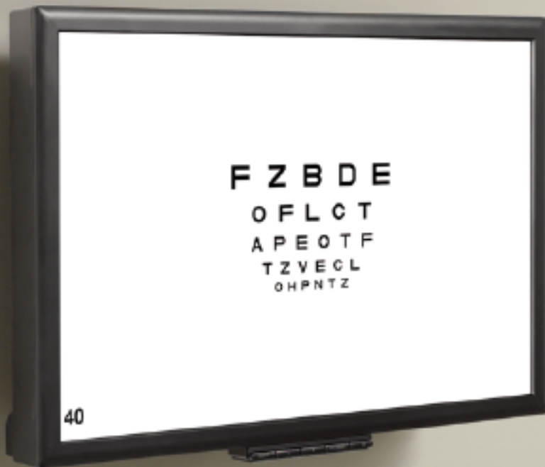
THE SMART SYSTEM 20/20 Now with a 20” Monitor—Standard!

Approved for clinical trials using E-ETDRS Protocol